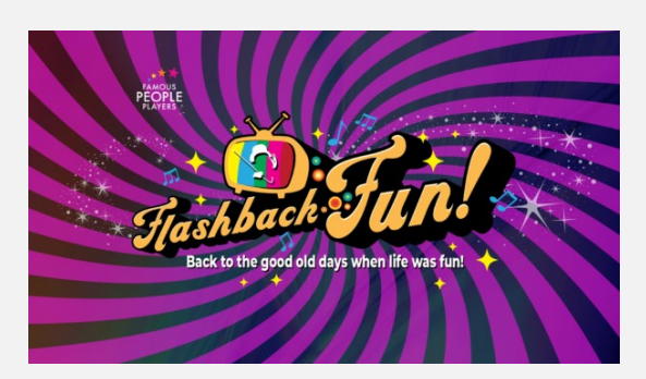
April 19 @ 11:30 am Famous People Players Theatre, 343 Evans Ave.

Cost: $70 per person including taxes, tip, lunch, and show