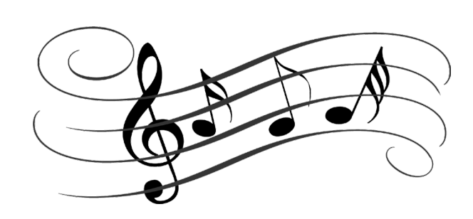
Choir Practice: Wednesdays @ 7:30 pm