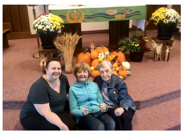
If you would like to place flowers on the altar in memory of or in honour of, pleased contact the church office.