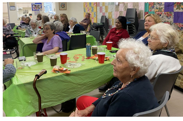
Please see page 7 for details on our next event scheduled for Thursday , November 16 .